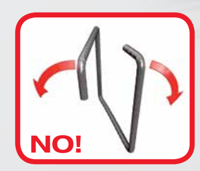
The twisting of the wire during the pulling phase creates open stirrups.

The combined action of an exclusive series of patented devices minimizes the time for setup adjustments and drastically reduces the amount of discarded products. A drive and control system, based on the latest generation technology, grants to reach unparalleled levels of productivity per hour.